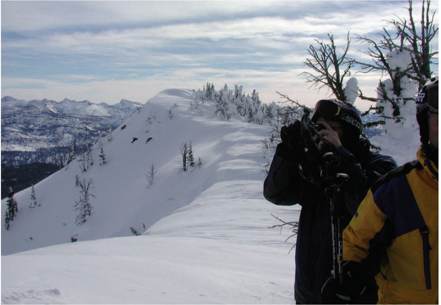
Brundage skier takes advantage of a photo op.

more likely, the sale was tied to the seismic shift that happened three months later.