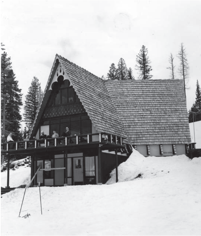
Top: Brundage Lodge, 1962, right page: Brundage, early days.

three initial ski runs and build a day lodge from locally harvested logs.