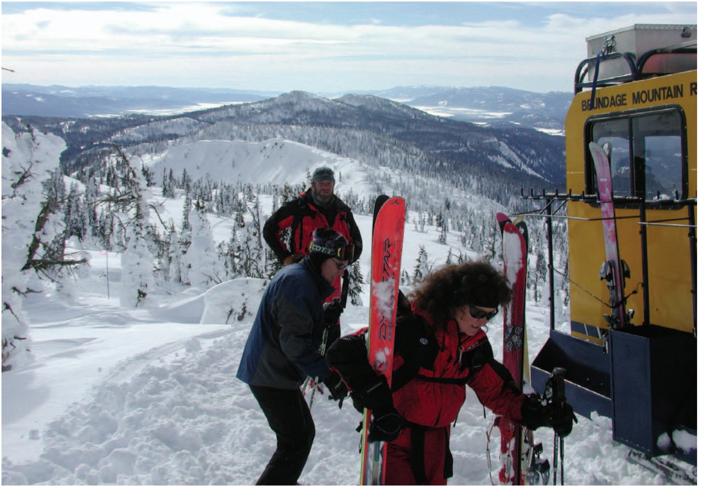
Snowcat trips are popular at Brundage.

involvement that included not just the Little Ski Hill and Brundage Mountain Resort, but a decade of serving as the local representative in the Idaho Senate.